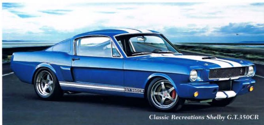
Classic Recreations Shelby G.T.350CR