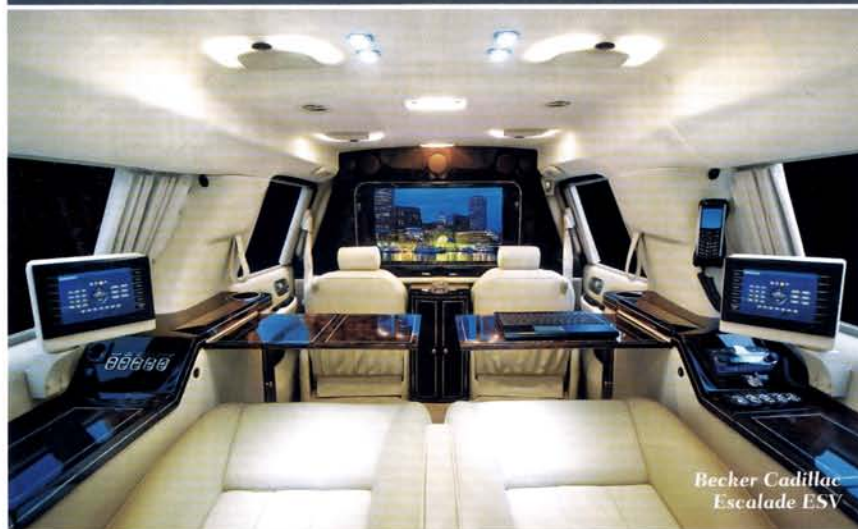
Becker Cadillac Escalade ESV