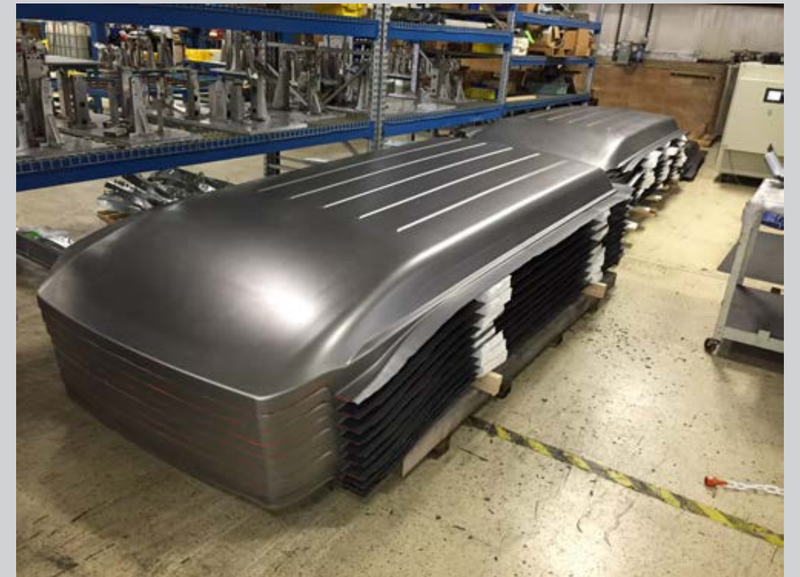
Single Stamped Steel Raised Roof