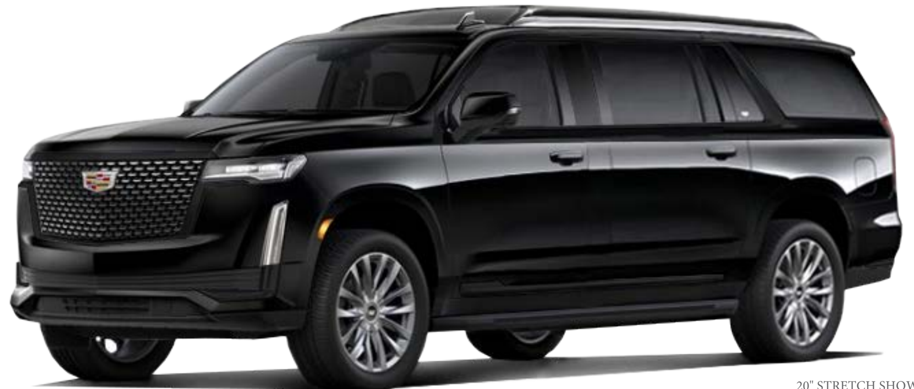
20" STRETCH SHOWN

Major ride quality improvements for 2021!